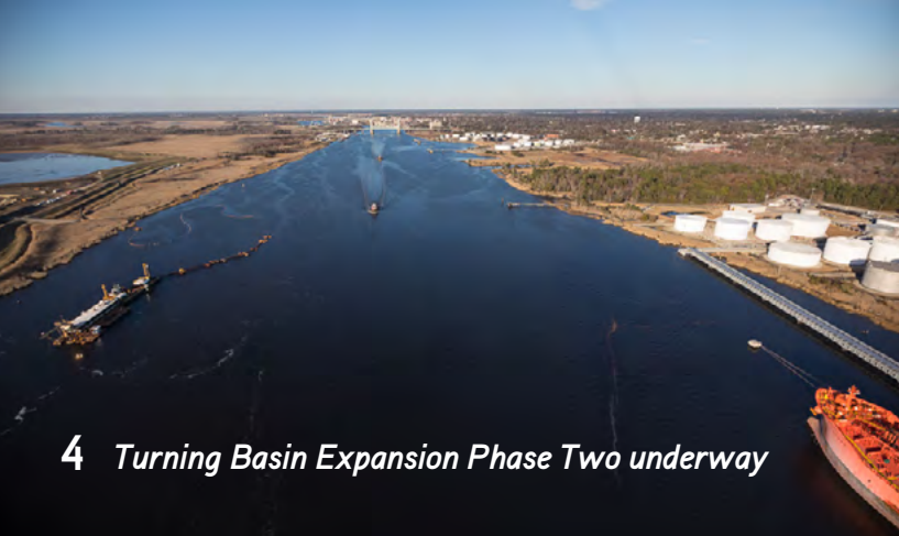
4 Turning Basin Expansion Phase Two underway