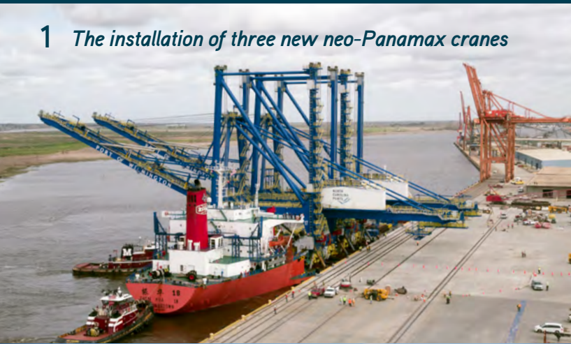
1 The installation of three new neo-Panamax cranes